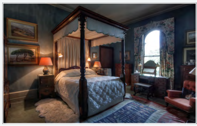
Blue Bedroom Double 4-Poster • Own Bathroom