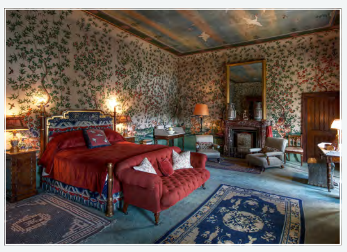
6 Queens Bedroom Double • En-suite Bathroom (or shared with 7)