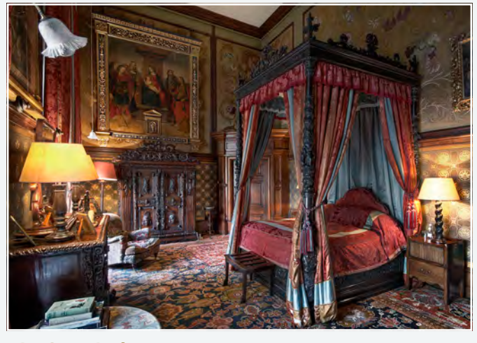
State Bedroom Double 4-Poster • En-suite Bathroom