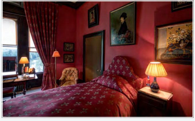
8 Lord Somers' Dressing Room Single • Shared Bathroom