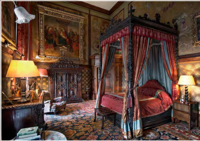
1 State Bedroom Double 4-Poster • En-suite Bathroom