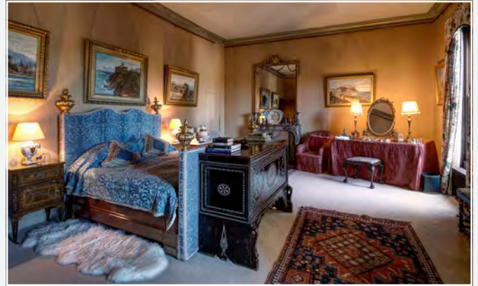
10 Italian Bedroom Double • En-suite Bathroom