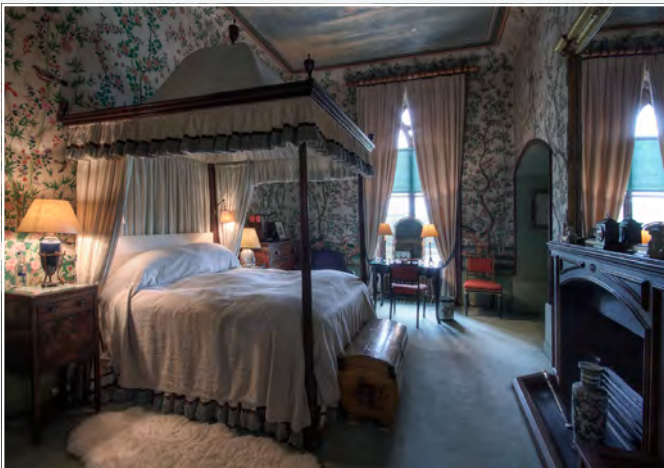
5 Chinese Bedroom Double 4-Poster • Own Bathroom