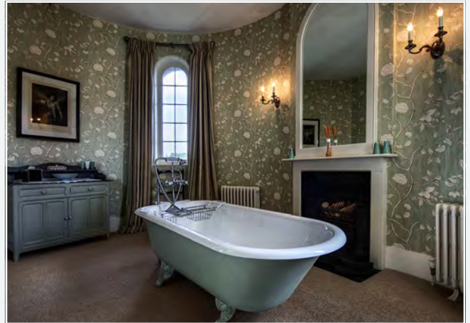
4 East Turret Bedroom Double • Own Bathroom (stairs to bathroom directly above)