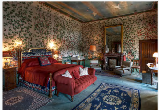
6 Queens Bedroom Double • En-suite Bathroom (or shared with 7)