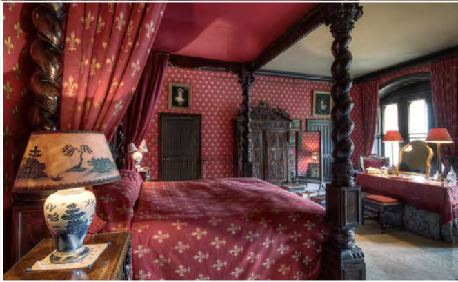
9 Red Bedroom Double 4-Poster • Own Bathroom (or shared with 8)