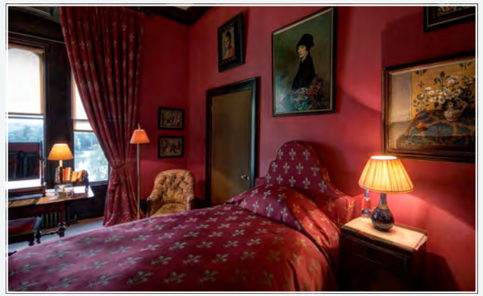
8 Lord Somers' Dressing Room Single • Shared Bathroom