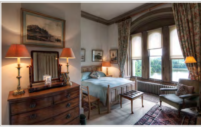
7 Chapel Bedroom Double • Shared Bathroom