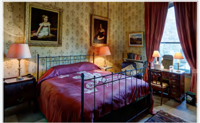
12 Pugin Bedroom Double • Own Bathroom