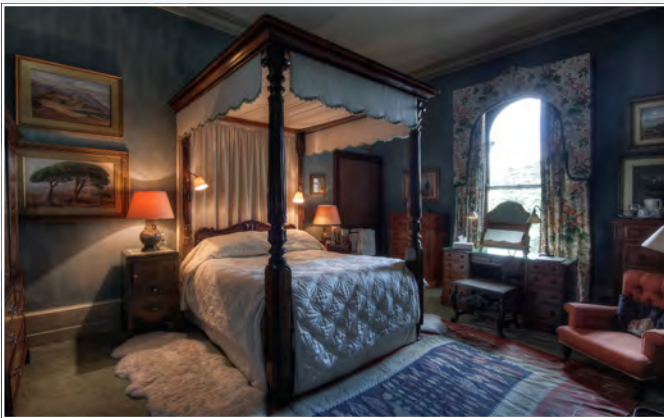
11 Blue Bedroom Double 4-Poster • Own Bathroom