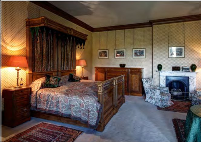
3 Tulip Bedroom Double or Twin • En-suite Bathroom