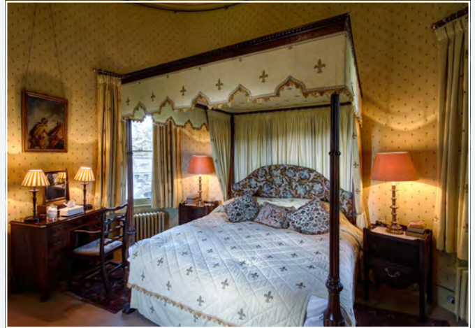
2 Turret Suite Double 4-Poster • En-suite Bathroom